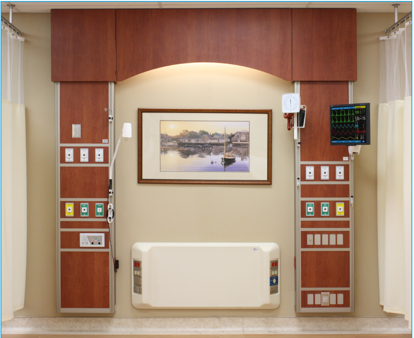
*picture shown with a decorative valance