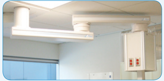
REVERSE ARM Ideal for low ceilings