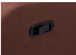
Recessed Handle for Recline*