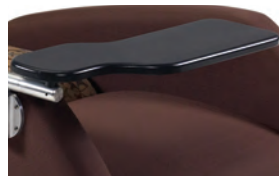
Pivoting Table (Single and Double)