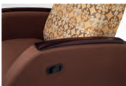
Polyurethane or Wood Arm Caps