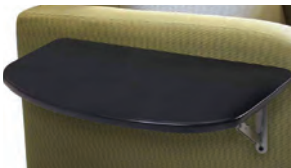
Flip-Up Side Table