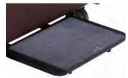
Pull-Out Foot Tray