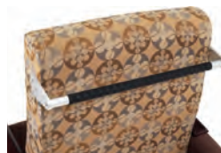
Metal Push Bar