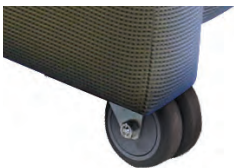
3" Non-marking Casters