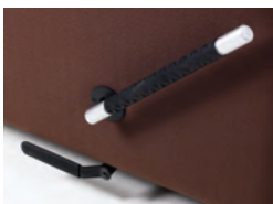
Lever-Controlled Foot Rest*